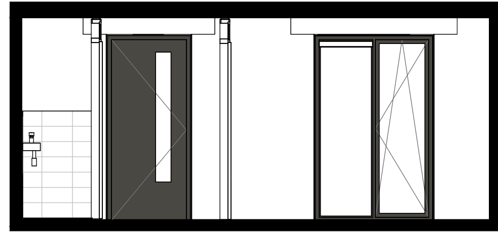
dwarsdoorsnede achter 1:50