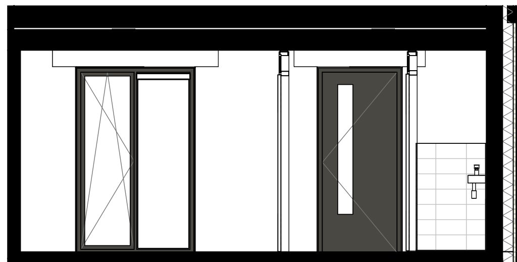
dwarsdoorsnede achter 1:50