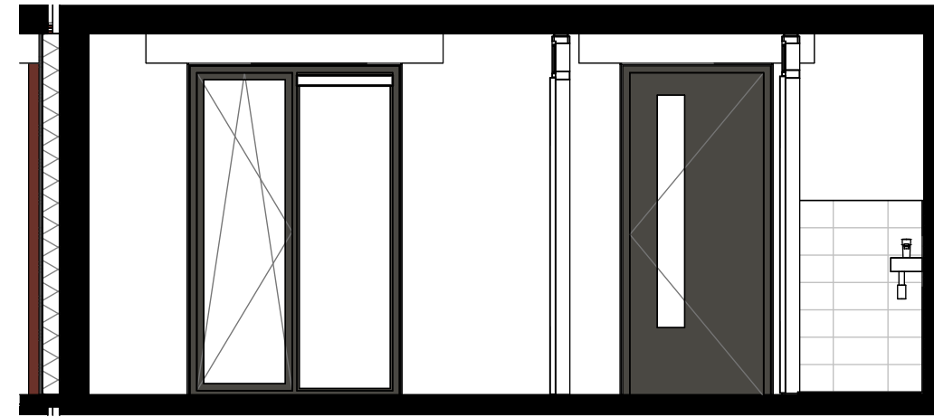
dwarsdoorsnede achter 1:50