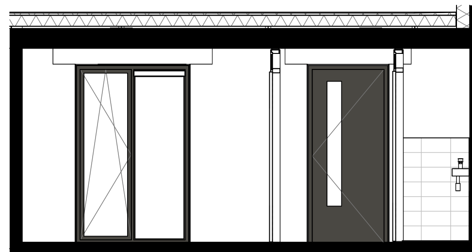
dwarsdoorsnede achter 1:50